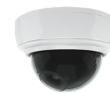
EXCA235BNCx Indoor Dome