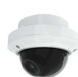
EXCA233BNCx Indoor Dome