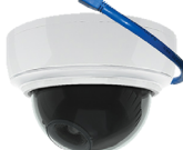
EXCA235CAT5x Indoor Dome