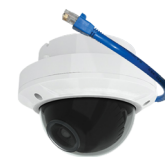
EXCA233CAT5x Indoor Dome