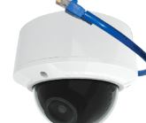
EXCA234CAT5x Vandal Dome