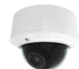
EXCA234BNCx Vandal Dome